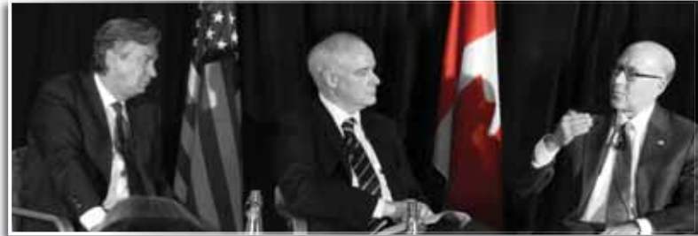
Perrin Beatty moderates a discussion with Gary Doer, Canadian Ambassador to the U.S. (left) and David Jacobson, U.S. Ambassador to Canada during International Trade Day. Ottawa, June 2.

This year's International Trade Day focused on Canada's trade relationships with its two leading trade partners – the United States and the European Union. Panellists discussed what must be done on Canada-U.S. border, energy and regulatory policy to make trade with the United States smoother for Canadian companies, and what needs to happen to get a